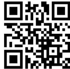
LSO Registration Site QR Code